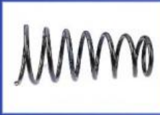
Shock Absorber Spring