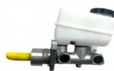
Brake Master Cylinder