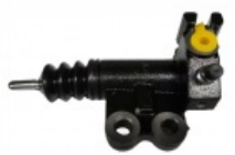
Brake Slave Cylinder