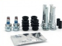
Brake Repair Kit