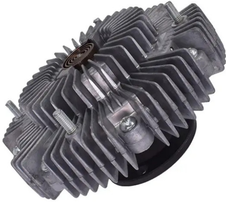
Figure 10-10 (continued)