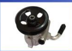
Power Steering Pump