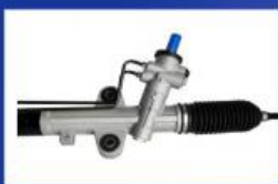
Power Steering Rack