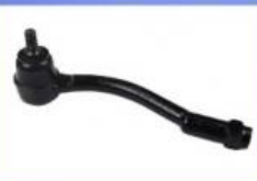
Tie Rod End