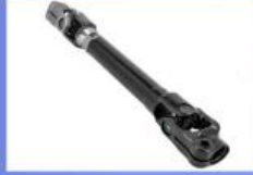
Steering Column Shaft