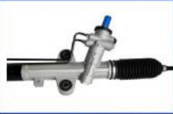
Power Steering Rack