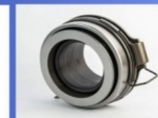
Clutch Release Bearing