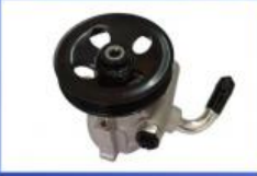
Power Steering Pump