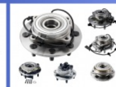
Wheel Hub Bearing