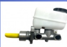
Brake Master Cylinder