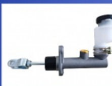
Clutch Master Cylinder