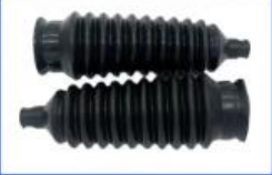
Steering Gear Boots