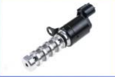
Oil Control Valve