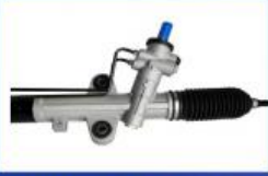
Power Steering Rack