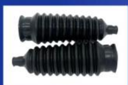
Steering Gear Boots